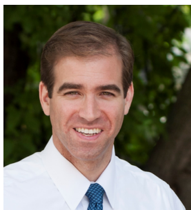
The Honorable Luke Bronin Mayor, City of Hartford

Luke Bronin was sworn in as the 67th mayor of the City of Hartford on January 1, 2016, and was reelected to a second term in November of 2019. Mayor Bronin is a husband, a father, a veteran, and an attorney, and he is committed to building a stronger Hartford for all of the city's residents.